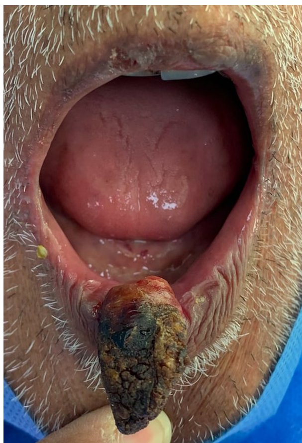
Fig. 1 Pyogenic granuloma.

On examination, there was a single pinkish mass with a sessile base (Fig. 1), 0.5 × 0.5 cm in size, arising from the lower lip. It was hard in consistency and had a desiccated appearance. It was mildly tender with minimal bleeding at the base on palpation. Differential diagnoses were cutaneous horn, basal cell carcinoma, keratoacanthoma, and pyogenic