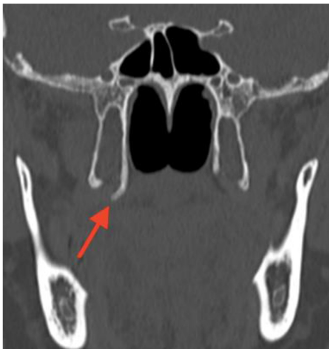
Fig. 1. Hypertrophy of the pterygoid hamulus (red arrow) on the computerized tomography – scan (coronal section).