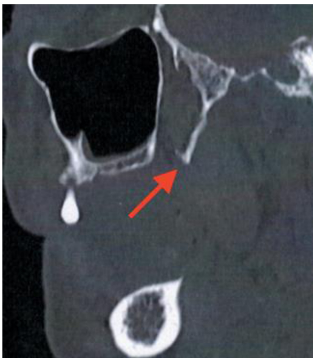
Fig. 2. Hypertrophy of the pterygoid hamulus (red arrow) on the computerized tomography – scan (para-sagittal section).

the sphenoid bone. It is medially bypassed by the tendon of the tensor veli palatini muscle that connects to the fascia of the veli. This tendon is covered with a bursa, whose main function is to decrease the friction exerted on the hamular process by