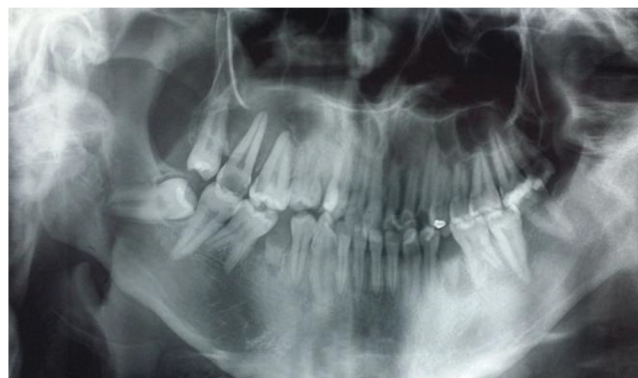
Fig. 6. Radiographs of 35 and 45 and an asymptomatic impacted 48.

The surgery selected was the least traumatic possible in the given circumstances. The patient was placed in a semi-sitting position, with the neck held straight to prevent hyperextension of the neck. The appointments were kept short.