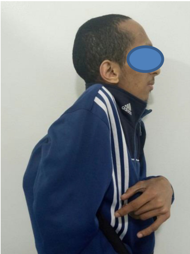
Fig. 2. Deformations related to heterotopic ossifications in the back.