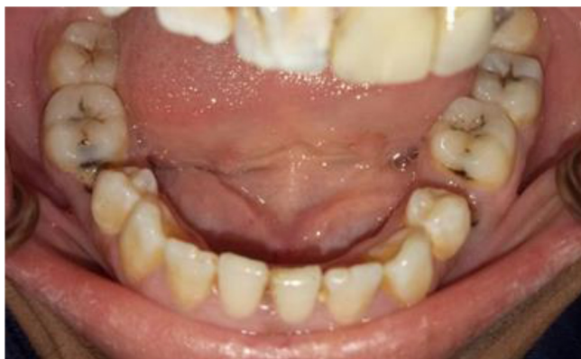
Fig. 5. Intraoral view of the lower jaw.