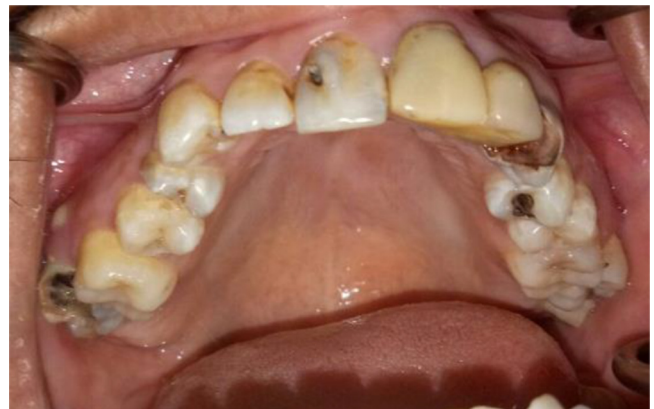
Fig. 4. Intraoral view of the upper jaw.

Oral clinical examination revealed a restricted jaw opening (20 mm), carious lesions on 11-12-23-27-36-37-38-46, pulpal necrosis on 17-14-35-45, and an asymptomatic impacted 48 (Figs. 4 and 5).