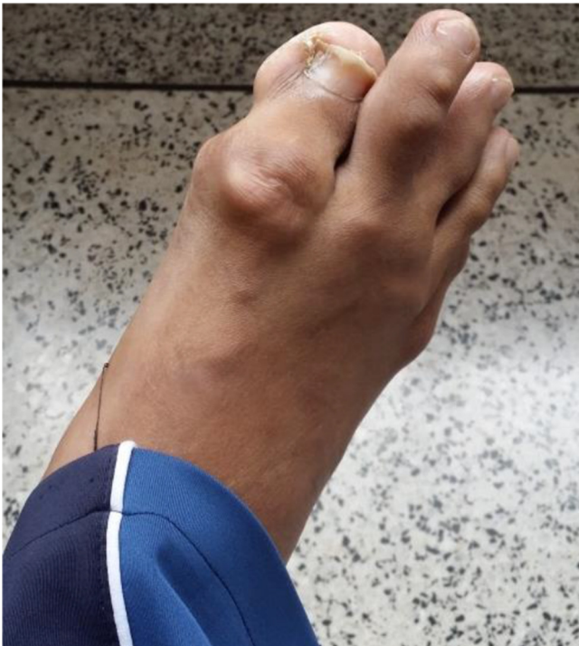
Fig. 1. Laterodeviation of the hallux.