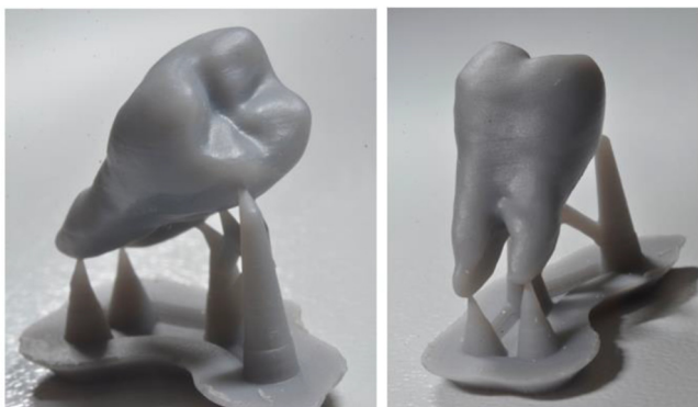
Fig. 3. Methacrylate resin transplant surgical template.