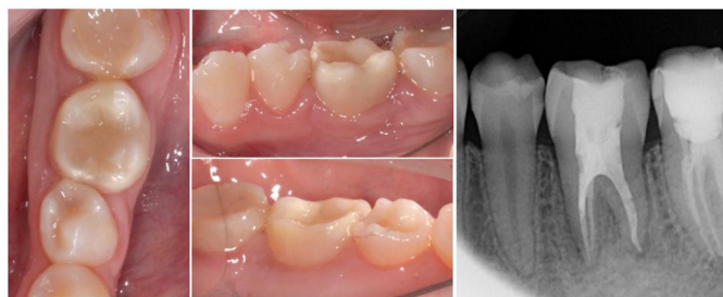
Fig. 6. Clinical and radiological situations 6 months after transplantation.

the missing tooth. In addition, by maintaining the periodontal ligament, possible orthodontic treatment can be considered in the long term if necessary.