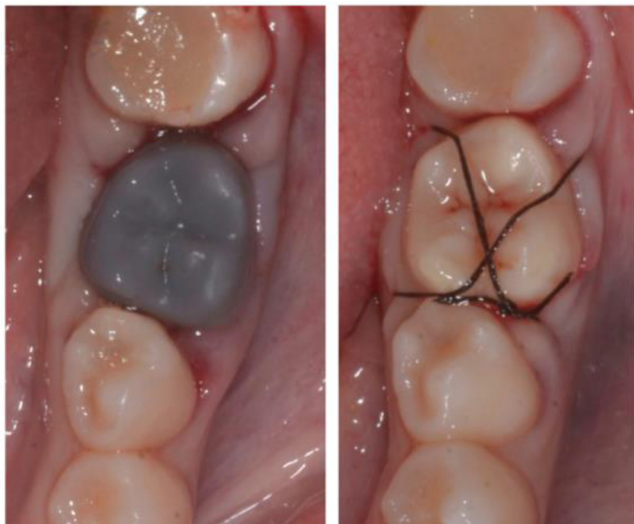
Fig. 5. Inspection of alveolar adaptation to the surgical template before transplantation, followed by the placement of the transplant.