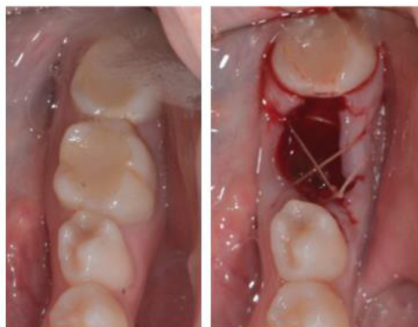
Fig. 4. Intraoral pictures before and after extraction of tooth 36.

which has not yet ossified and is rich in growth factors; this promotes the proper integration of the transplant and reduces the risk of ankylosis [13,14].