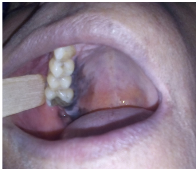
Fig. 1. A 56-year old man with a large mucosal pigmentation, extending from the right maxillary canine to the tuberosity.

Amalgam tattoos are common, exogenous, pigmented lesions of the oral mucosa, resulting mainly from the accidental displacement of metal particles in oral soft tissues during restorative dental procedures using amalgam. The diagnosis is simple; clinically, amalgam tattoo presents as slate-gray, bluish, or black macules. Lesions are usually uniformly round, uniformly pigmented, and measure between 0.1 and 2 cm [1]. They mainly affect the mandibular gingival mucosa, buccal mucosa, floor of the mouth, tongue, retromolar mandibular area, lips, and palate [2]. Periapical X-ray examination may be useful to detect the radiopacity associated with amalgam. However, less than 25% of amalgam pigmentations are radiopaque and visible on radiography [2,3].