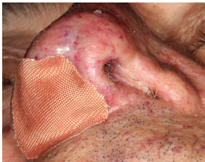
Fig. 2. Lower view of nose: complete closure of the nasal cavities as a result of Young's procedure.

is made in accordance with Curaçao's diagnostic criteria, defined in 1997. Three out of four of the following signs must be present [4]: